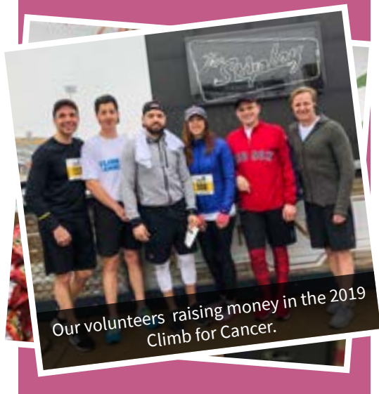
Our volunteers raising money in the 2019 Climb for Cancer.

Even COVID-19 can't stop us! Throughout these challenging times, Blue Wavers continue to step up virtually to show their support. We're looking forward to recruiting even more volunteers as we work towards another 10 years of giving back. Thanks to the Blue Wave Committee for all of your hard work and helping us to land this fantastic achievement!